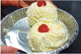
Perfect for consumption, and topped with a red cherry, the Parmesan Cheese Ball.

The Mankato BPW is still reeling from the success of our cheese ball fundraiser. The Mankato BPW “mixing” date for cheese balls was Wed. Nov. 19th and the “rolling/delivery” date was Nov. 23 (Right before Thanksgiving / Christmas / Super Bowl.) We offered three flavors of cheese balls: Plain, Tangy Chipped Beef and Pecan with Raspberry. Our goal this year was to sell 100 cheese balls and we sold 272! Total profit, including matching funds was over $2,500!