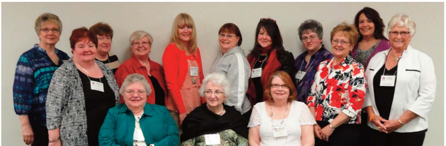
PSP's at the last state convention...April 2014

We take a break from meetings during July and will resume our regular meeting schedule with a member-hosted picnic in August.